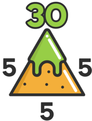
Figure out the pattern and find the value of the '?' in each of the following: