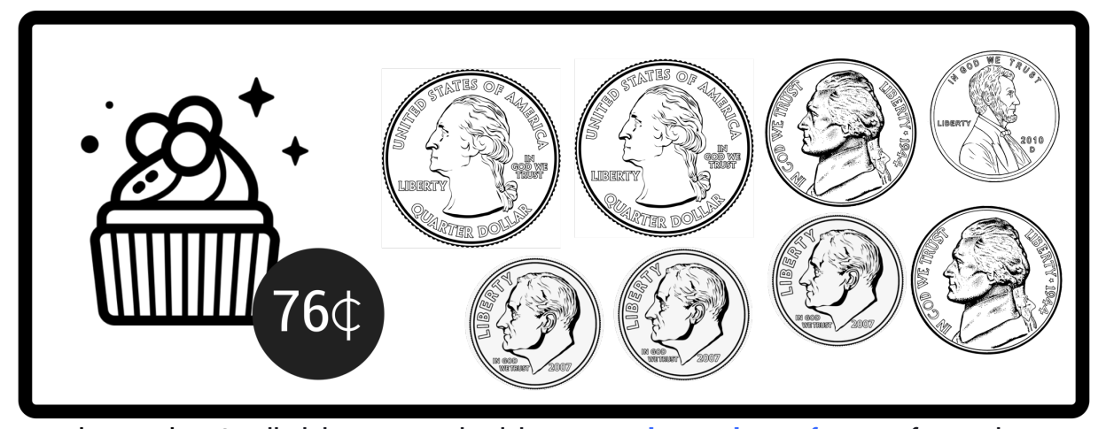
Visit www.mashupmath.com for more fun math resources.