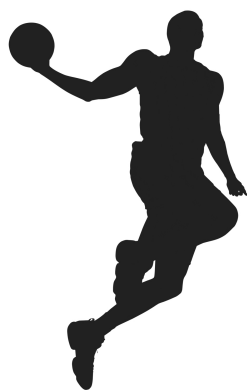
Points Scored Per Game

Use your math skills to determine which of the three statements below is a dirty lie! Explain how you made your decision.